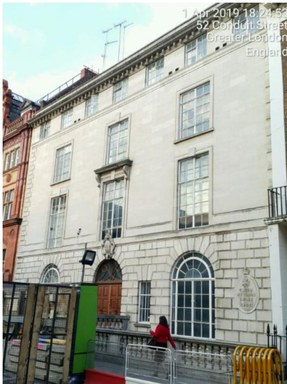
Front elevation (Davies Street)